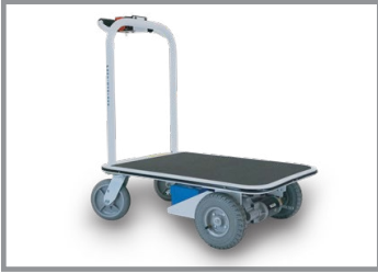
1040: 1,000 LB. CAPACITY