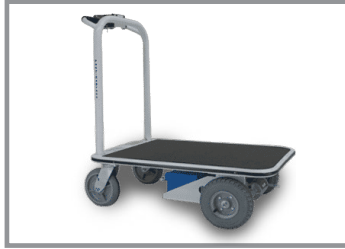
1040-E (Extreme): 1,000 LB. CAPACITY, 15° INCLINE